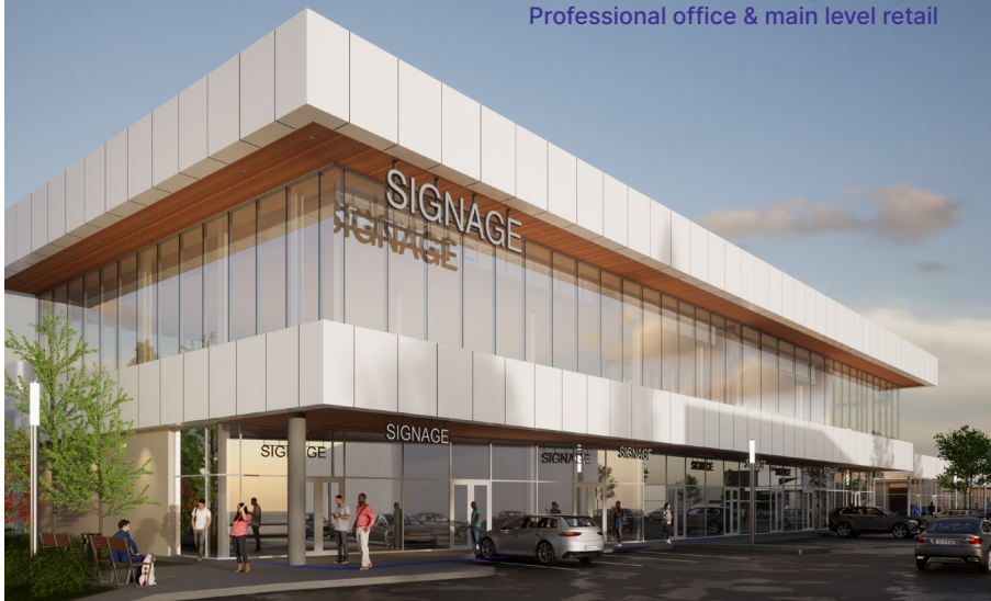
BUILDING A Professional office & main level retail